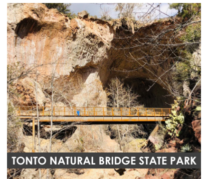
TONTO NATURAL BRIDGE STATE PARK