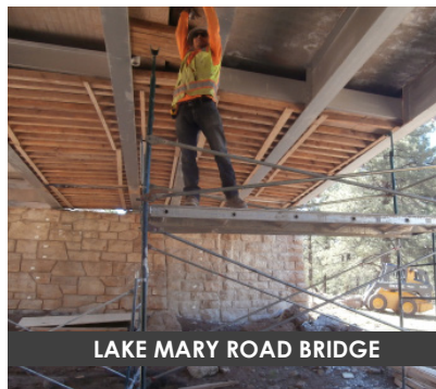
LAKE MARY ROAD BRIDGE

SWP specializes in general contracting, new pavement preservation and maintenance, underground construction, earthwork and excavating, demolition, major and minor concrete work and bridge repair and construction. We regularly perform work with alternate delivery methods such as JOC, CMAR and Design-Build with municipal and federal clients.